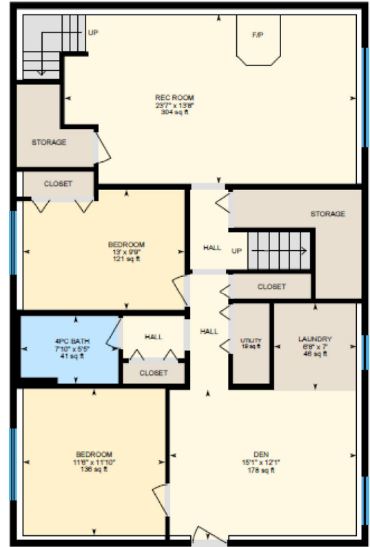
Lower Exterior Area 1217.18 sq ft