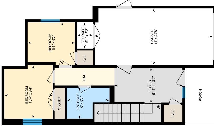
Lower Floor Exterior Area 496.21 sq ft