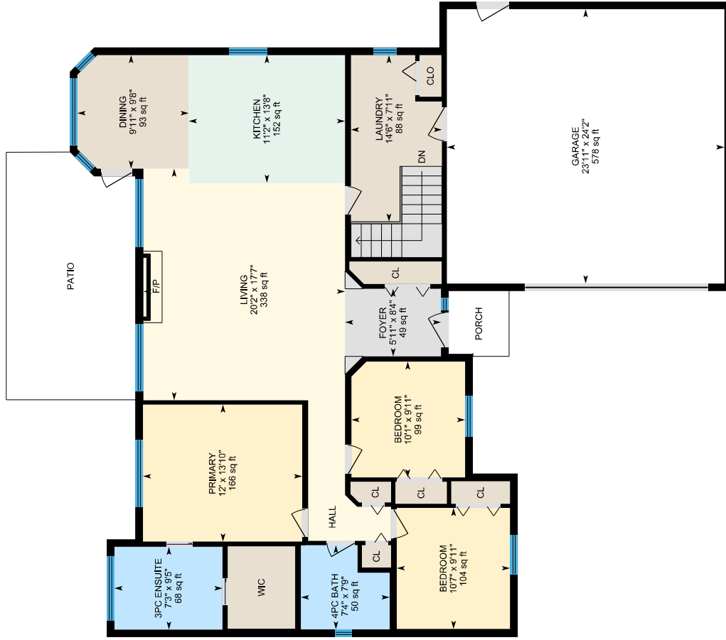
Main Floor Exterior Area 1589.89 sq ft

Main Building: Total Exterior Area Above Grade 3126.96 sq ft