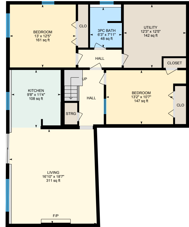
Basement (Below Grade) Exterior Area 1253.04 sq ft