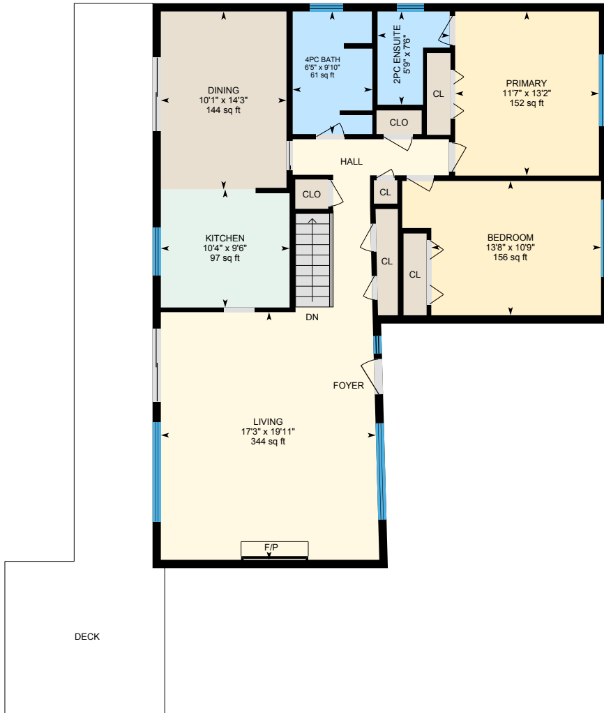
Main Floor Exterior Area 1305.46 sq ft

Main Building: Total Exterior Area Above Grade 1305.46 sq ft