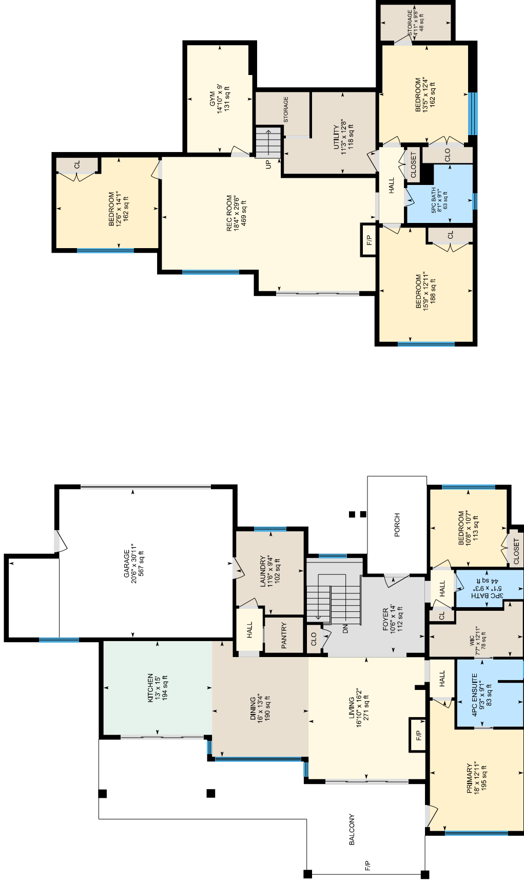
Main Floor Exterior Area 1785.98 sq ft

Main Building: Total Exterior Area Above Grade 3501.21 sq ft